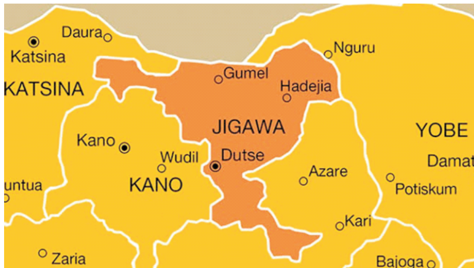
Figure 1: Map of Jigawa State

Tsire is a boneless lean meat which is cut into pieces and sliced with a sharp knife, staked on a wooden/iron stick and heavily dusted with a mixture of spices made up of groundnut cake paste, red pepper,