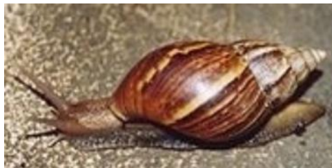
Plate 3. Achatina fulica