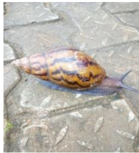
Plate 1: Achatina achatina

and highly nutritious with no cholesterol, compared to that of other animals; the meat is low in fat (0.05 – 0.08%), contains high levels of protein (12 – 16%), iron content (45 – 50mg/kg) and almost all the essential amino acids required by man (Dauda et al. , 2017) and hence serves numerous medicinal benefits. Several species exist and; Cobbinah et al. (2008) documented Archachatina marginata , Achatina achatina , Achatina fulica as the most predominant snails in Africa. Achatina achatina (Plate 1) is the largest gastropod among the giant African land snails, which can grow and reach shell length of up to 27cm (Venette and Larson, 2004). Archachatina marginata (Plate 2) is the second largest, while Achatina fulica (Plate 3) is the smallest (CAB, 2003; Venette and Larson, 2004). But in Nigeria, Achatina achatina is the second most popular breed of snail after Archachatina marginata which is the most accepted, highly cherished, commonly kept and reared (Okon et al. , 2012; Ejidike and Uzuseba, 2017).