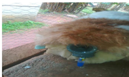
Figure 2: The posterior of the dummy with the LAV inserted