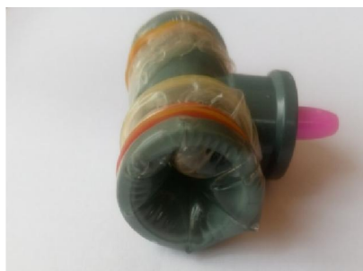
Figure 1: an LAV filled ready for use

Three dummies used had same length of 25.5cm but differ in dimensions (height, girth circumference and position of AV from the floor) but had the same structure made with binding wires, stuffed with a thick foam for support and a flat foam to cover the wires before the skin was place on top to reduce the hardness when mounted. Dummy A (12cm, 40cm and 5cm from the floor in a hole), Dummy B (12 cm, 33cm and 6cm in a slit behind), Dummy C (10cm, 29.5cm and 7.5cm in a slit behind).