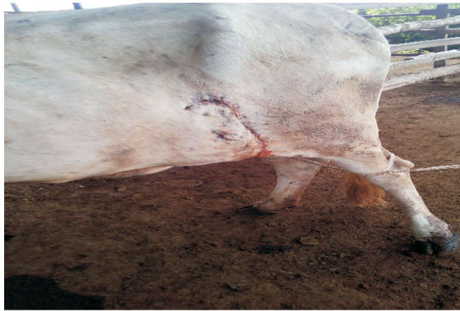
Figure 4: Picture showing the animal five days post-surgery.

The pathology result of the affected subcutaneous tissue revealed diffused degeneration and caseous necrosis of the myofibres characterized by pyknosis, karyorrhexis and karyolysis of the myofibres (white arrow). There were