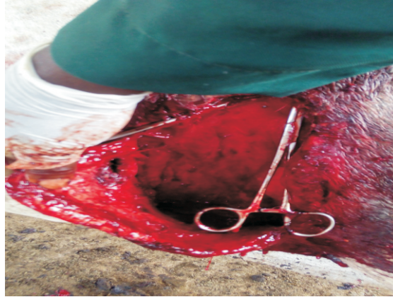
Figure 2: Showing the wall of the abdomen after removal of the insissipated pus

Post-operative management: Twenty (20) ml of Penicillin-streptomycin was infiltrated at the site of operation, and Penicillin-streptomycin at 20,000 IU/20mg/kg bodyweight 2mg/kg of Flunixin and 10mg/kg of Multivitamin were administered intramuscularly for five days with hypodermal needle and syringes. The cattle was then hospitalized on the farm separate from the other cattle, feed daily on grass and concentrate and water were given ad libitum .