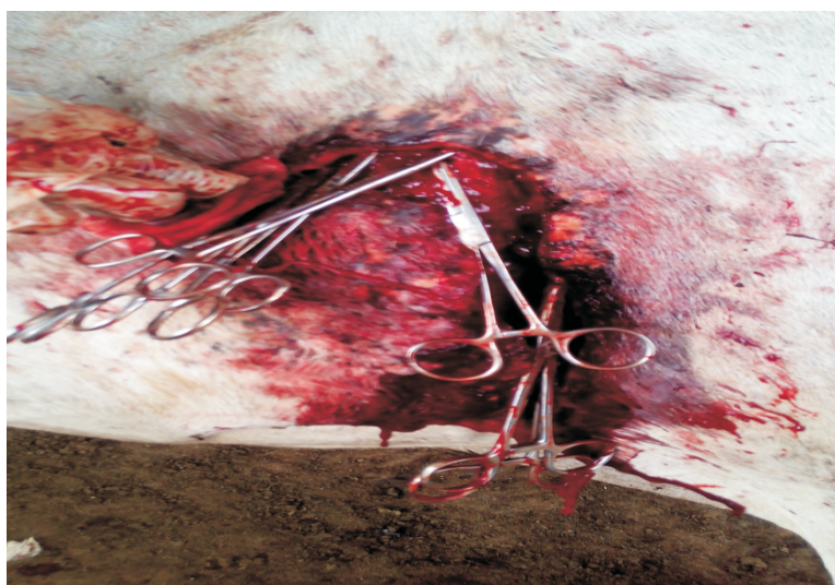
Figure1: Showing control of haemorrhage during surgery

around the swelling with a size 3 surgical blade and using the blunt edge of the blade, a blunt dissection was done slowly and carefully between the skin and the capsule of the abscess. The blood vessels, branches of the lumbar vein, encountered were ligated (2-clamp method) and severed to enable a complete detachment of the abscess while hemostasis of the small blood vessels was done by pressure and crushing using mosquito forceps (figure 1). Then dissection of the capsule was continued until complete excision of the abscess was achieved. The abscess weighing about 350g was taken to pathology laboratory for histopathology.